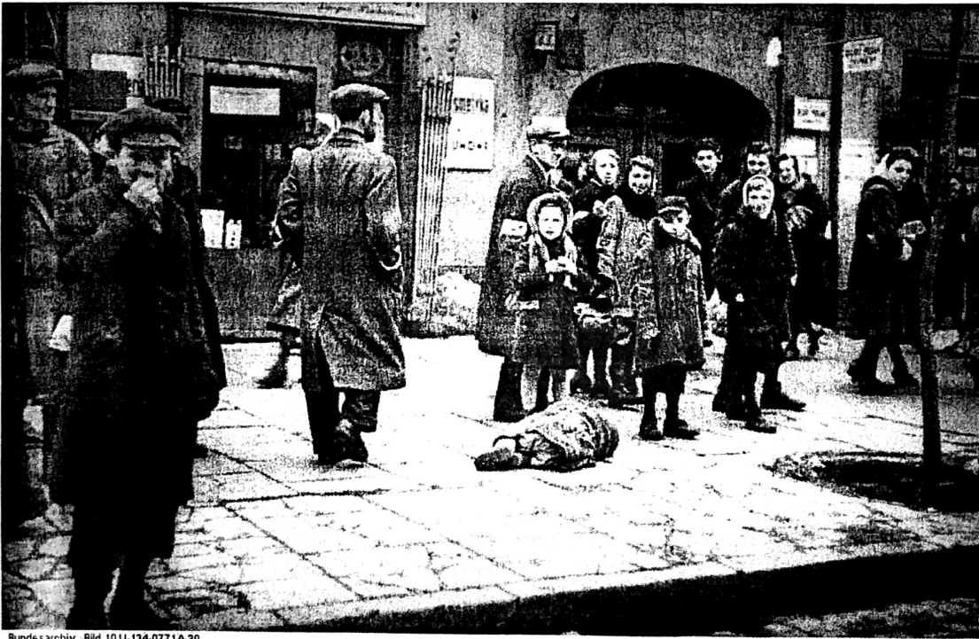
Bild 101I-134-0771A-30 Mai 1941